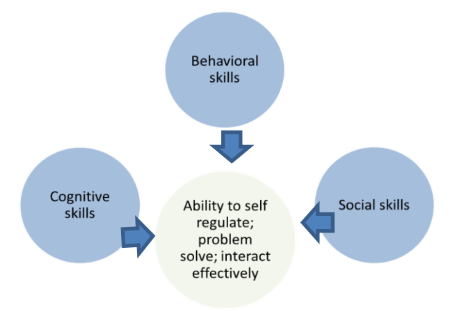
Figure 1. Simplified Prodigy Model Characterizing the Skills Taught and Abilities Learned

The Prodigy program addresses all three of these characteristics in that it enhances positive attitudes and teaches self-regulatory skills in an effort to reduce and/or prevent crime and violence. It also educates youth about the arts and encourages their curiosity and talents in this area. Finally, the safe and engaging Master artists nurture relationships and mentoring opportunities in a safe, positive environment.