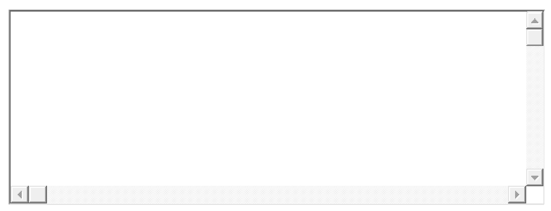
(3,500 Character Limit, including spaces)

Programmatic Activity notes : Provide any notes about your programmatic activity. (1,000 Character Limit, including spaces)