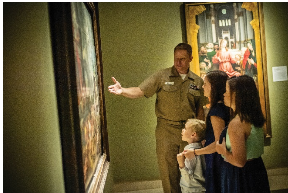
Blue Star Museums.

The National Endowment for the Arts distributed more than $6,556,800 in grants in Connecticut .