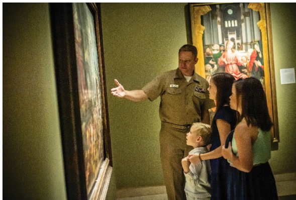
Blue Star Museums.

The National Endowment for the Arts distributed more than $4,235,100 in grants in Idaho.