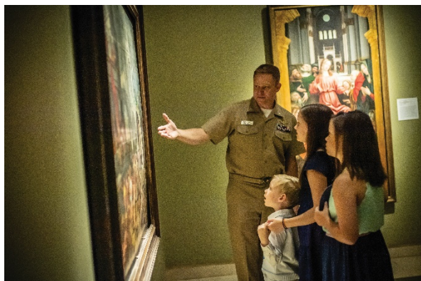
Blue Star Museums. Photo by Debra Huskin

The National Endowment for the Arts distributed more than $9,927,000 in grants in Ohio .