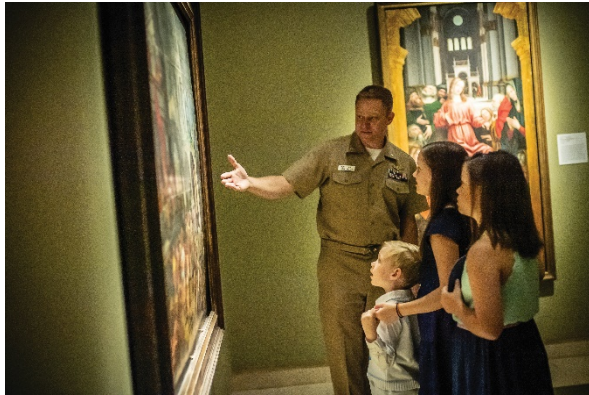
Blue Star Museums.

The National Endowment for the Arts distributed more than $12,247,900 in grants in Washington .