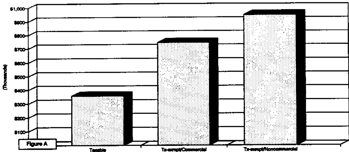
1987 Average Total Receipts/Revenues for Museums and Art Galleries

Figure A shows the average receipts/revenues for each type of museum/art gallery. The average total revenue of tax-exempt (nonprofit) commercial museums was over twice the total receipts of taxable museums; tax-exempt (nonprofit) noncommercial museums was almost three times higher.