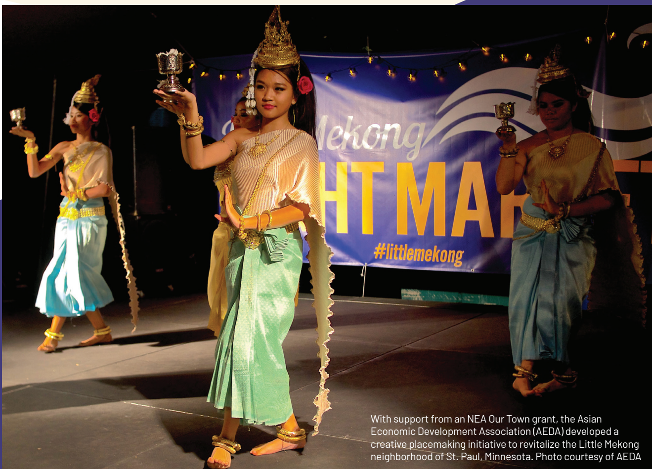
With support from an NEA Our Town grant, the Asian Economic Development Association (AEDA) developed a creative placemaking initiative to revitalize the Little Mekong neighborhood of St. Paul, Minnesota.