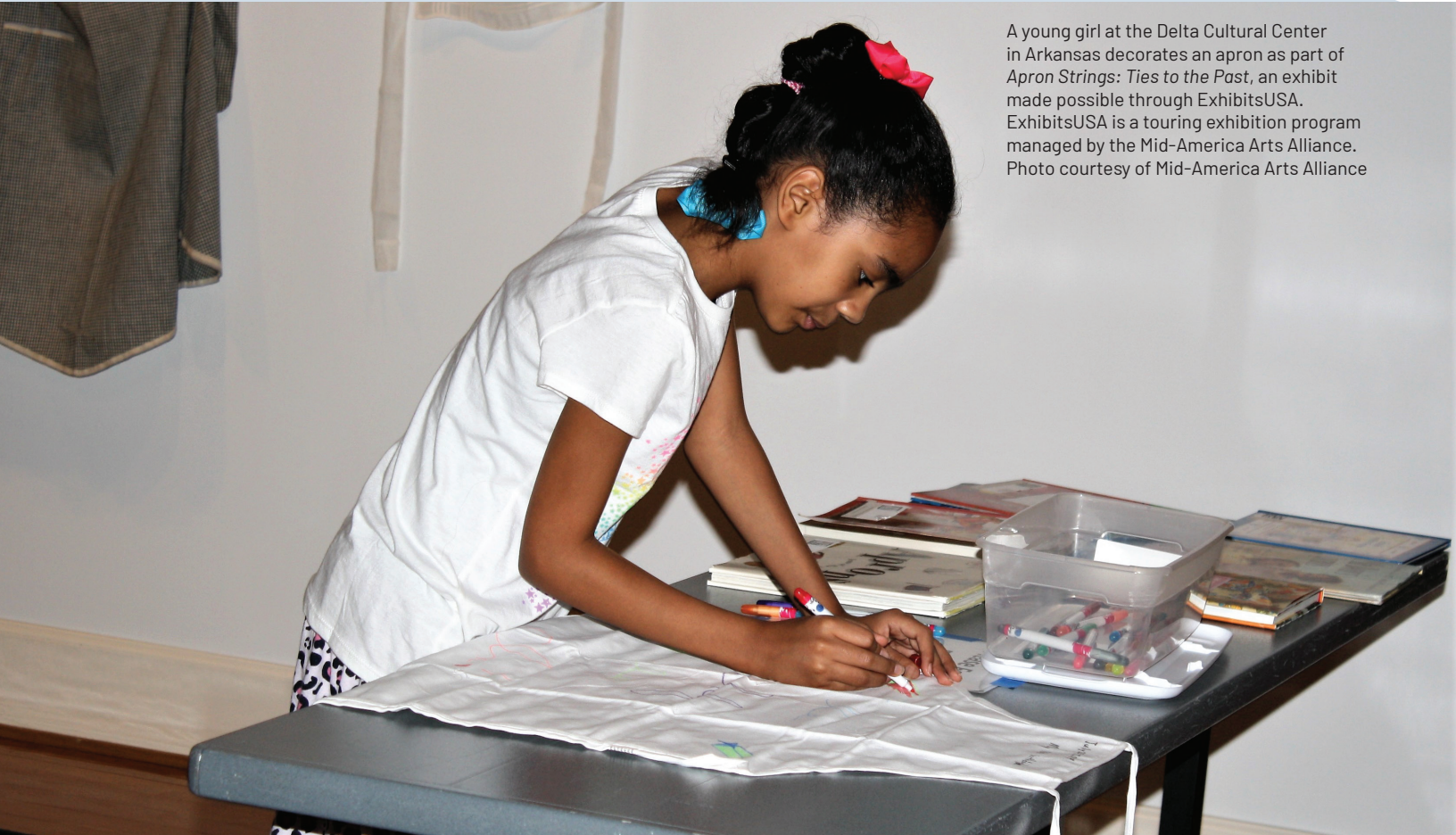
A young girl at the Delta Cultural Center in Arkansas decorates an apron as part of Apron Strings: Ties to the Past, an exhibit made possible through ExhibitsUSA. ExhibitsUSA is a touring exhibition program managed by the Mid-America Arts Alliance.