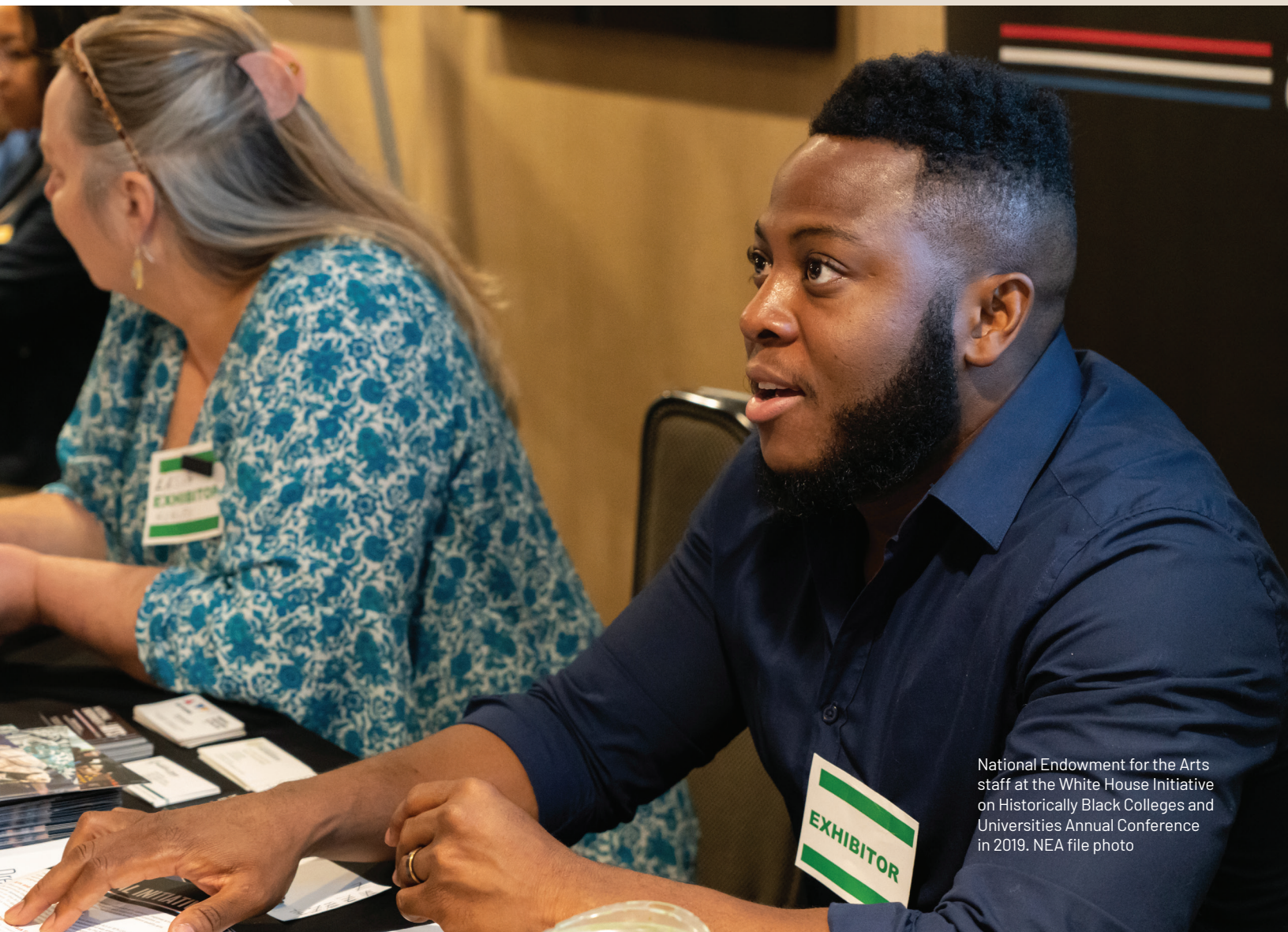
National Endowment for the Arts staff at the White House Initiative on Historically Black Colleges and Universities Annual Conference in 2019.

of our communities and provide all Americans with diverse opportunities for arts participation. The Arts Endowment has provided crucial support at pivotal moments in their history for arts organizations such as the American Ballet Theatre, American Film Institute, Appalshop, Deaf West Theatre, Jazz at Lincoln Center, National Black Arts Festival, Steppenwolf Theatre Company, Spoleto Festival USA, and the Sundance Film Festival. For more than five decades, the Arts Endowment has supported activities such as performances, exhibitions, healing arts projects, art education programs, arts and community development initiatives, festivals, and artist residencies throughout the country.