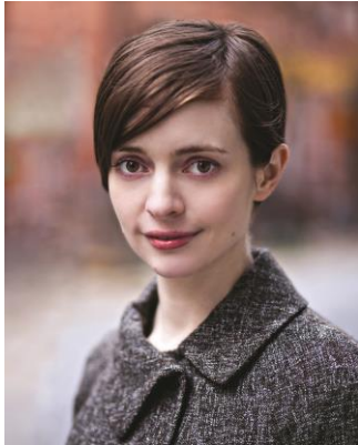
Emily St. John Mandel

"I've always been interested in writing about memory, and in what it means to live honorably in a damaged world." — Emily St. John Mandel in an interview with the National Book Foundation