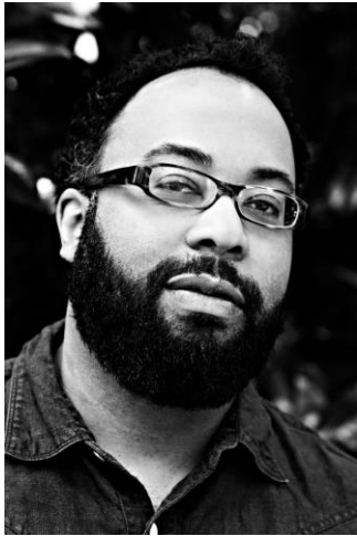
Kevin Young

"Like Jean-Michel Basquiat said about painting, when I'm working I don't try to think about art, I try to think about life. The job of the poem is to bridge the two, to take us out of the world and hopefully deposit us back unsettled but satisfied." — Kevin Young on Failbetter.com