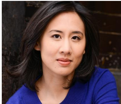
Celeste Ng

"Can we ever really understand our children? Our parents? I want the answer to be yes." — Celeste Ng in Omnivoracious