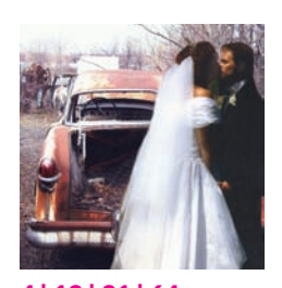
4 | 13 | 31 | 64