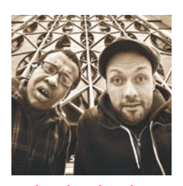
13 | 31 | 51 | 56 | 60