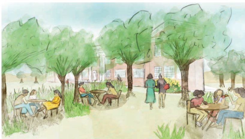
▲ Map of Fort Apache Historic Park and rendering of proposed gathering space.