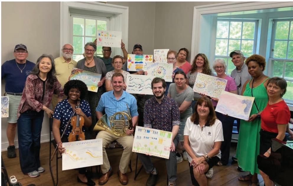
▲ Group photo of At Ease participants with their final artworks of the 2023 Water(color) for the Soul Music Composition Residency with Black Moon Trio.